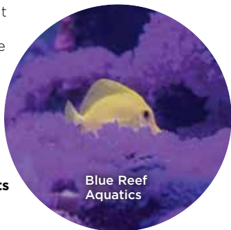
Blue Reef Aquatics

The first thing you'll notice when you walk into Blue Reef Aquatics (5960 Losee Road) is the impressive 450-gallon mixed-reef display aquarium. Opened in 2010 by Greg and Donna Harris, Blue Reef is the largest independent tropical fish and reef store in the area, offering an extensive selection of coral, saltwater and freshwater fish. They stock everything fish enthusiasts need for their aquariums: protein skimmers, air pumps, water pumps and power heads, aquarium lighting, fish food, refugiums, aquarium filters, aquarium heaters, and more. They'll even help you install and set up your aquarium.