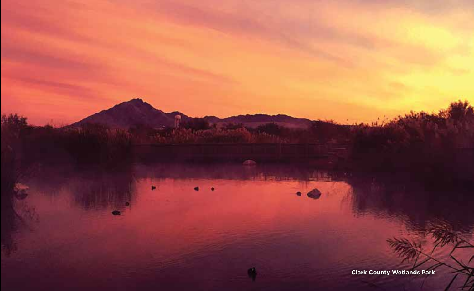
Clark County Wetlands Park