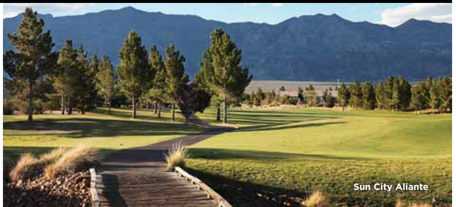
Sun City Aliante

The Aliante area comprises a cluster of subdivisions, each with its own features and attractions. The Fields at Aliante offers four- and five-bedroom designs that range from 2,228 to 3,374 square feet. The homes feature two-