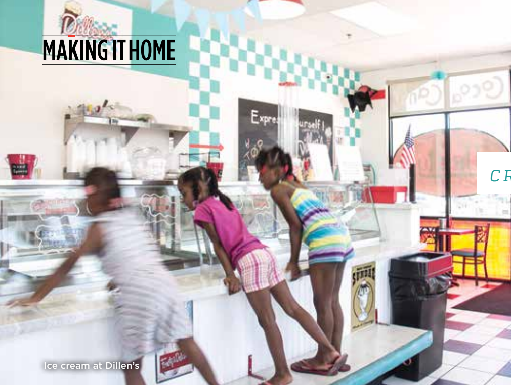
Ice cream at Dillen's