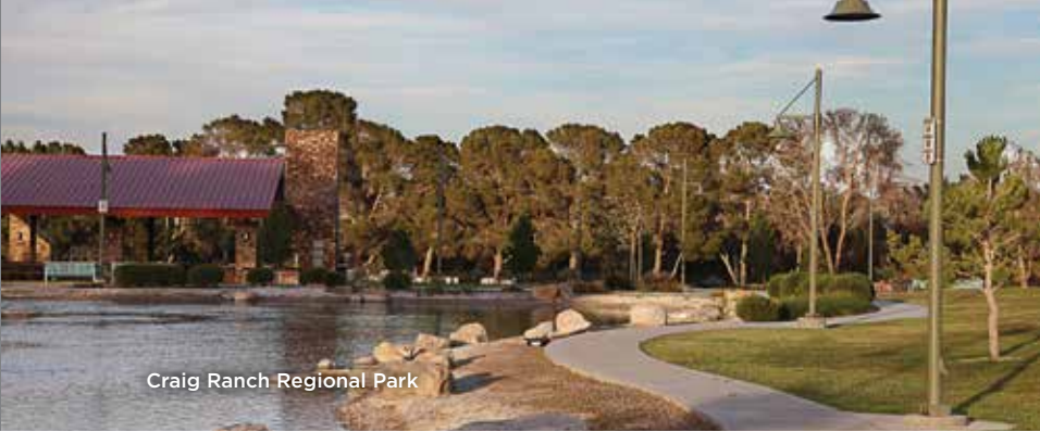
Craig Ranch Regional Park